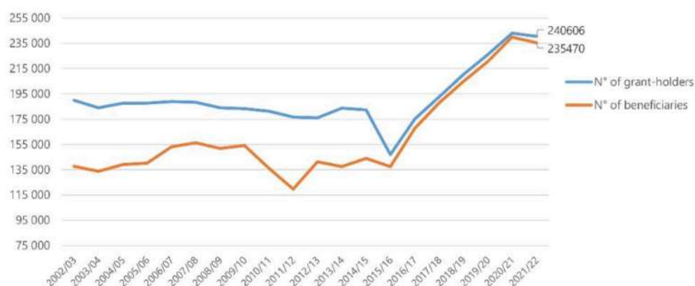
Figure 2 | Number of grant-holders and number of beneficiaries in Italy, 2002/03-2021/22.

Government-funded university scholarships are not only few and far between, but the transfer of funds to students is slow to arrive, meaning that they often serve mainly as reimbursement (or partial reimbursement) for expenses already incurred. Grants generally come in two instalments, with the first half typically paid out between November and the end of December, which is three to four months after courses have begun. In some cases, first-year students must satisfy the merit requirement (earning 20 credits by August 10) before receiving the entire amount in a single instalment, which could be at the end of the June at the earliest, or as late as in the autumn. One has to wonder how students manage to support themselves while waiting for their grant money to arrive if their families are unable to provide support.